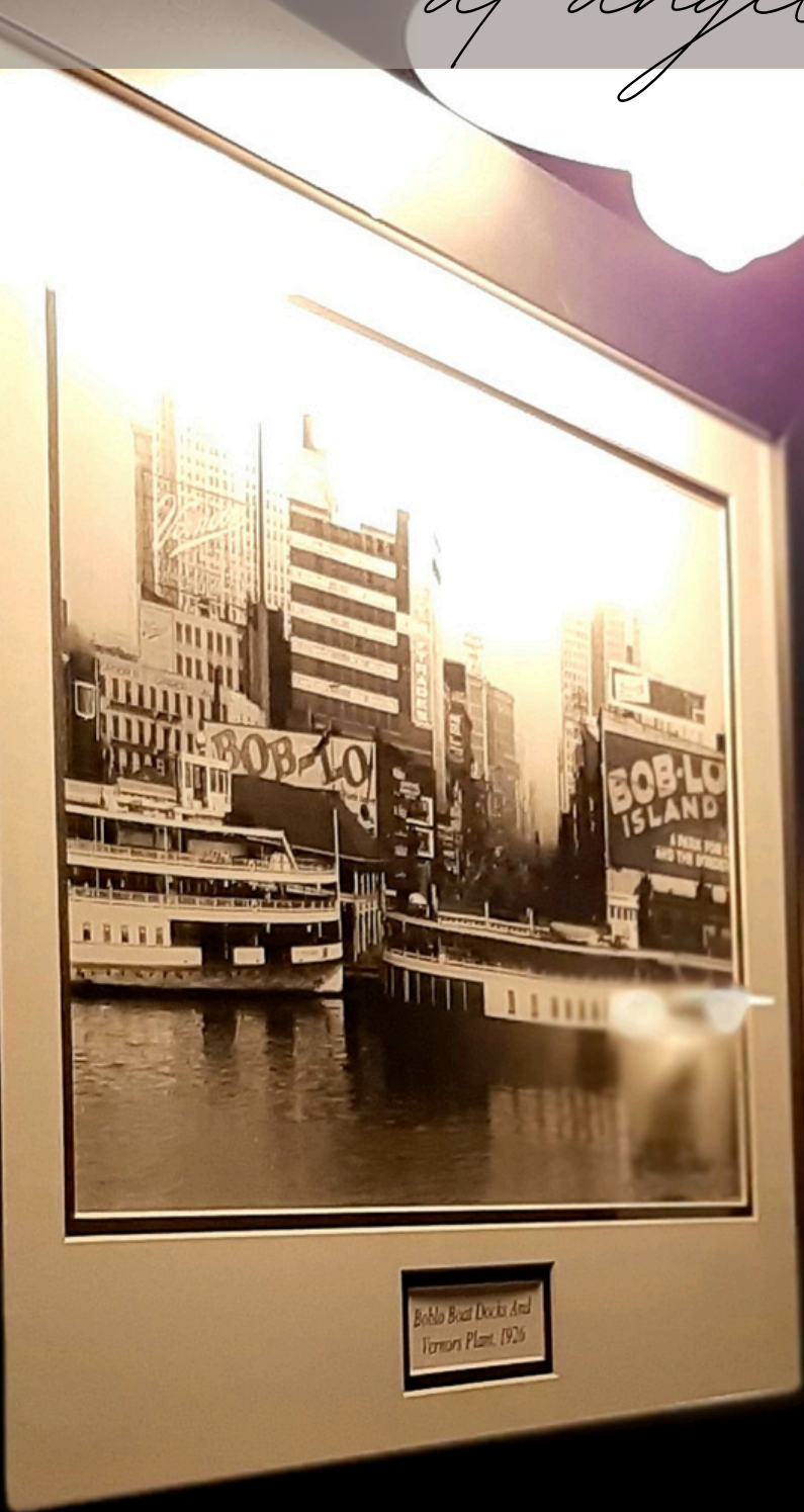
Boblo Boat Docks And Ferries Plant, 1926

Serving Michigan's Tastes with Heavenly Delights